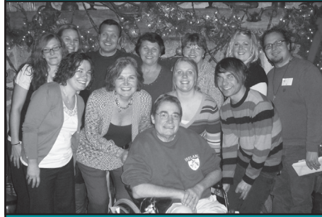
The staff of TYME OUT Youth Center

Total Youth Ministry Experience Openness Understanding Trust